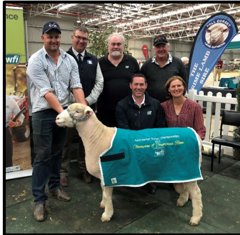
WFI 2023 Champion of Champion Ram – Springwaters Stud