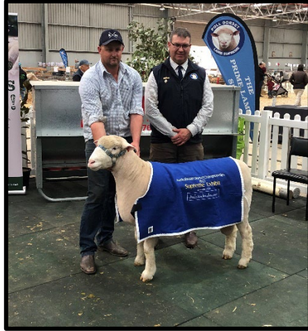
2023 Supreme Exhibit of Show – Springwaters Stud