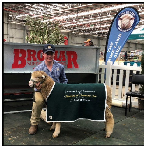
2023 Champion of Champion Ewe – Valley Vista