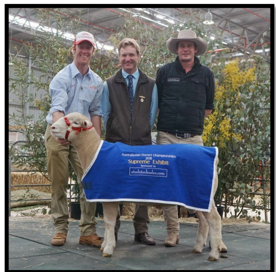
2018 Supreme Exhibit of Show – Tattykeel