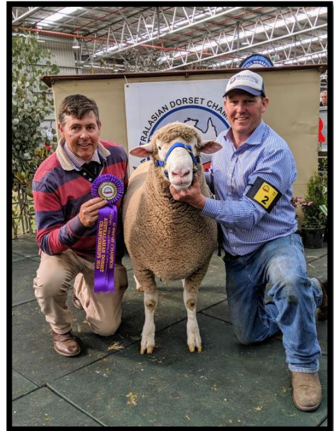
2019 Supreme Champion Ram – Abelene Park