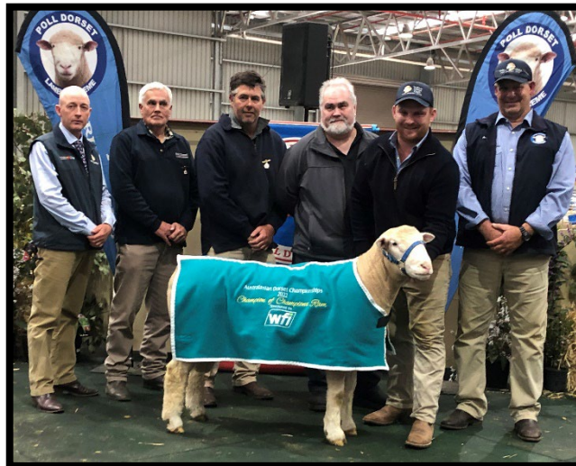
WFI 2022 Champion of Champion Ram – Valley Vista