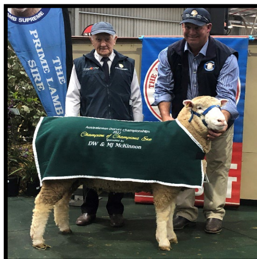
2022 Champion of Champion Ewe – Valley Vista