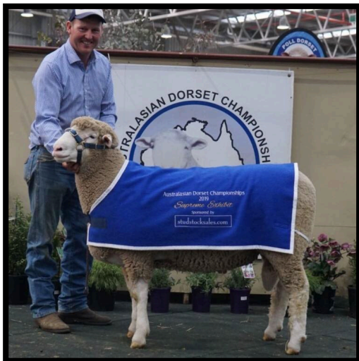
2019 Supreme Exhibit of Show – Abelene Park