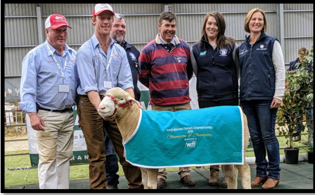
2019 WFI Champion of Champions Ram - Tattykeel