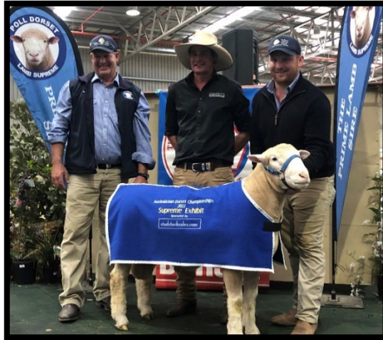
2022 Supreme Exhibit of Show – Valley Vista